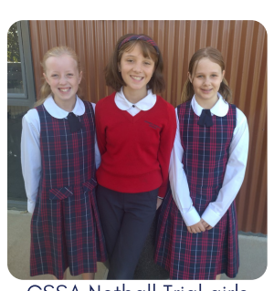
CSSA Netball Trial girls